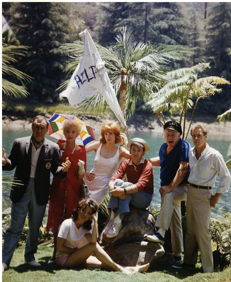
GILLIGAN'S ISLAND cast at the lagoon - and below setting up for a shot.

Most of the cast did not particularly like having to go in the lagoon and it was rumored around the lot that when they would occasionally drain the lagoon, bicycles and bodies were found at the bottom. Bicycles true, bodies only myth.